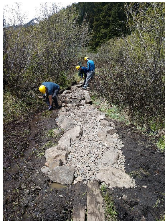
Indian Peaks Wilderness Alliance Partner Project – Turnpike Construction on South Boulder Creek Trail (June 22, 2019)