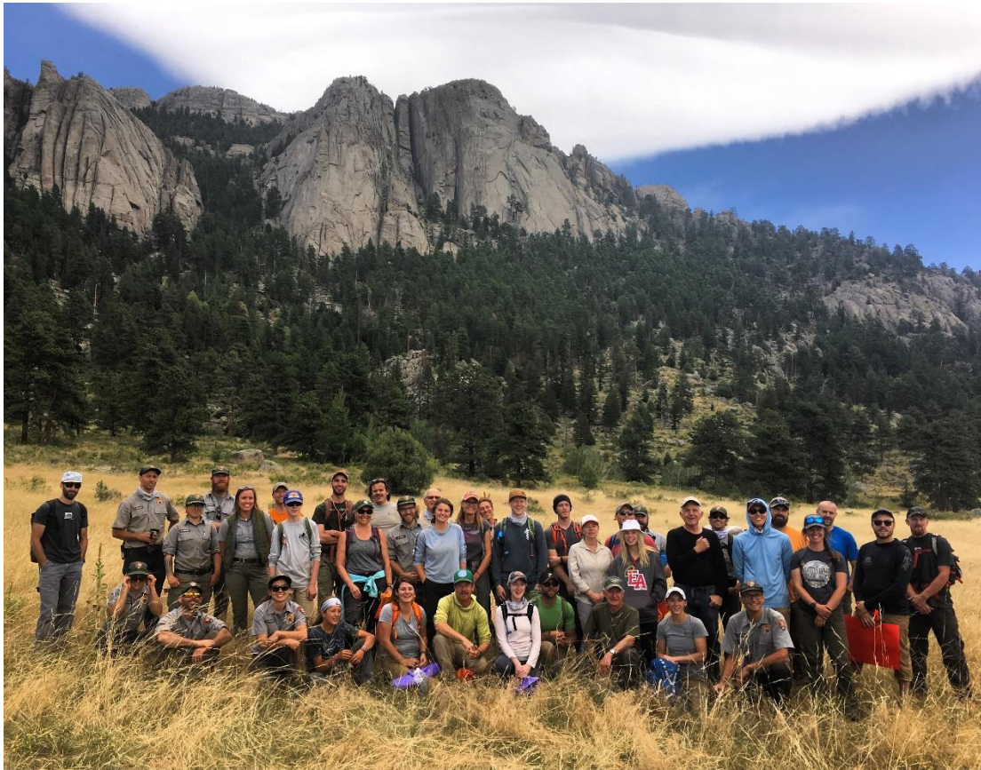
Rocky Mountain Rendezvous (August 24, 2019)

Resources – The 2019 Resource Stewardship projects helped to restore habitat and foster native plant growth by: