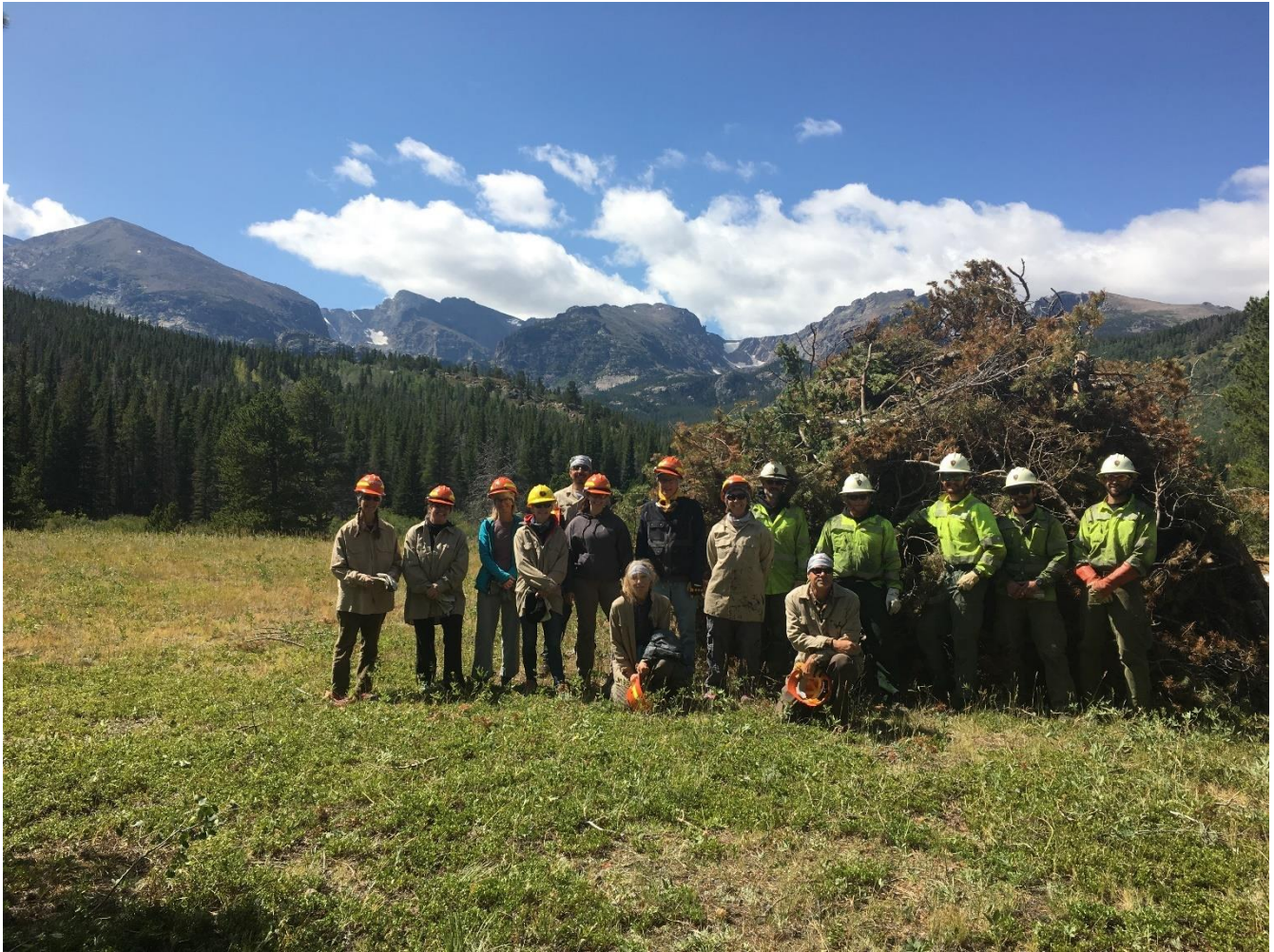
9/11-National Day of Service and Remembrance (September 12, 2019)

The Rocky Mountain Conservancy would like to thank all the volunteers as well as our project partners. THANK YOU!