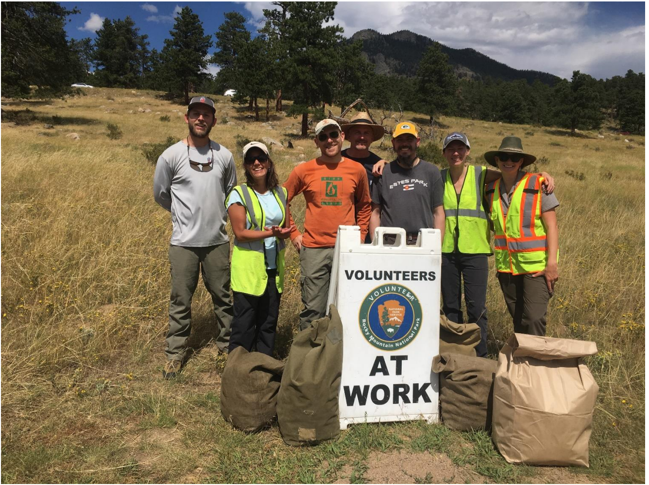
Town of Estes Park staff after mechanically removing invasive plants in Moraine Park (September 4, 2019)