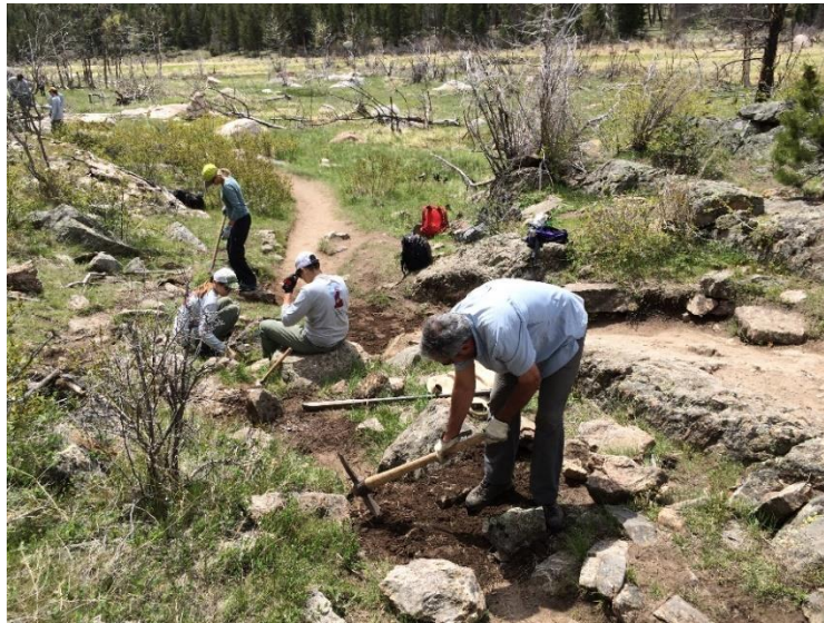
National Trails Day – Cub Lake Trail Restoration (June 1, 2019)