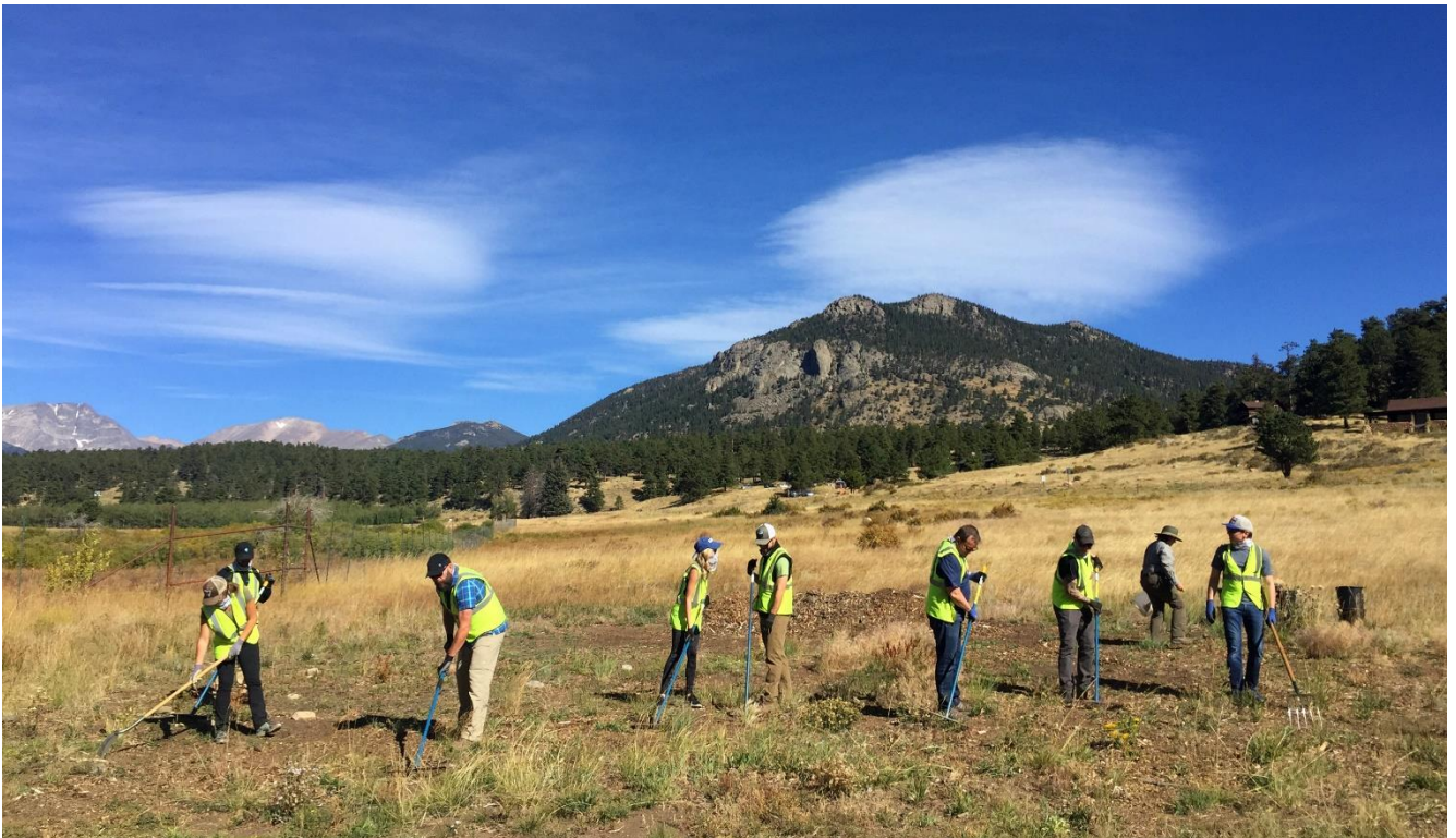
Raking mulch and seed to finalize restoration efforts in Moraine Park (September 26, 2019)