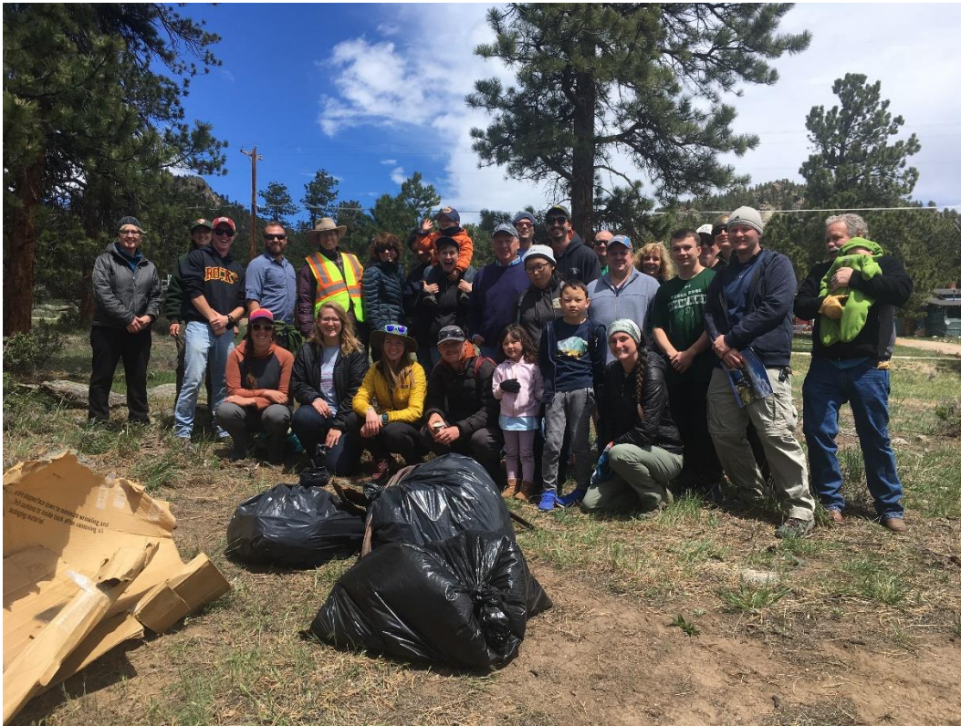
Colorado Public Lands Day (May 18, 2019)