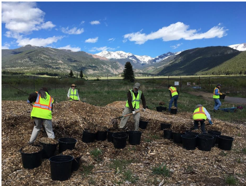
Transporting and repurposing mulch in Moraine Park (June 12, 2019)