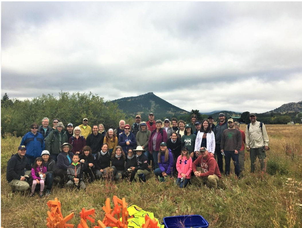
National Public Lands Day (September 28, 2019)