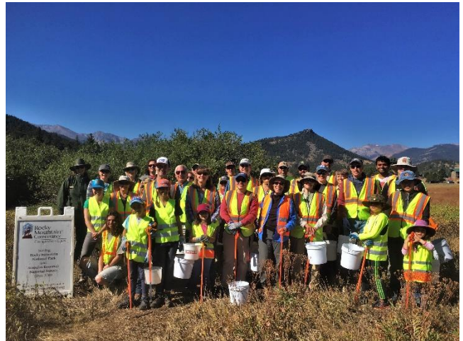
National Public Lands Day volunteers enjoy a beautiful day while removing litter from Beaver Point!