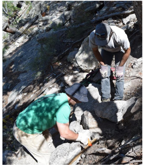
Rocky Mountain Rendezvous participants clearing trail of debris, constructing check steps and post-project group.