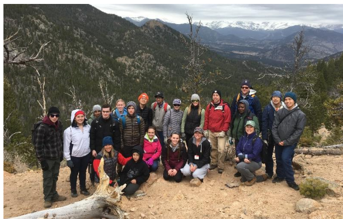
National Ocean and Science Bowl hike around Lily Lake and enjoy Lily Lake overlook after maintaining the trail.