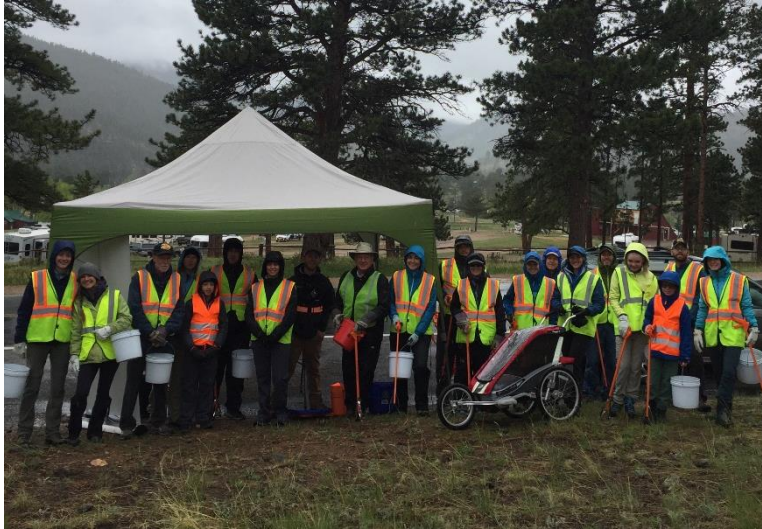
Volunteers brave the weather to clean-up Rocky on Colorado Public Lands Day.