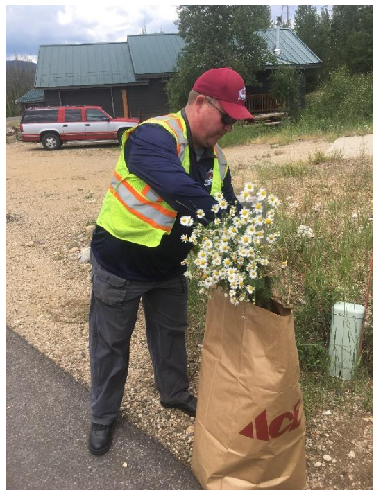
Volunteers pull and package Scentless Chamomile near the Kawuneeche Visitor Center.