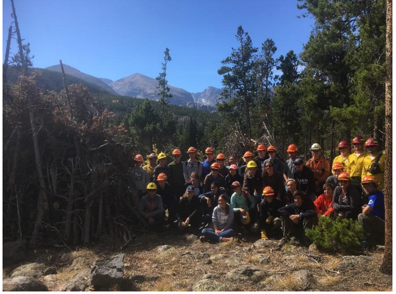
Volunteers for Outdoor Colorado: CAIRN Youth Program kicks off their 2018-19 season with a fuel reduction project.

The Rocky Mountain Conservancy would like to thank all of the volunteers who support the program, as well as our project partners. THANK YOU!