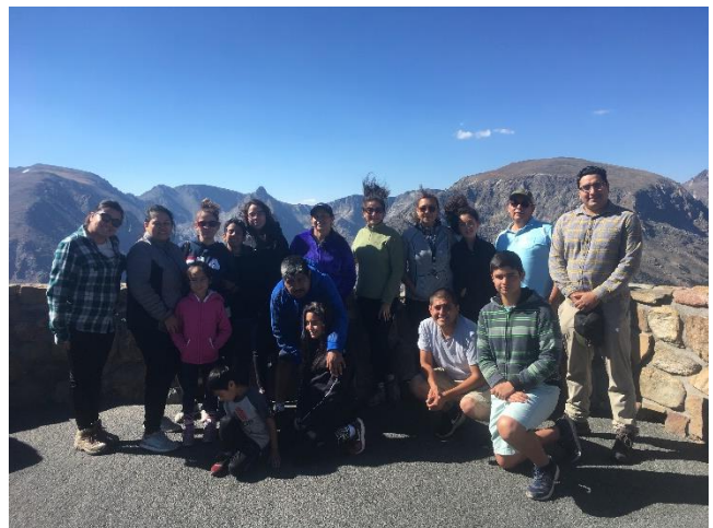
Nature Kids/Jovenes de la Naturalez cleaning up Moraine Park and enjoying Rocky Mountain National Park.