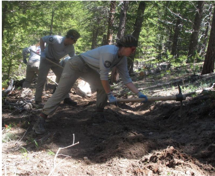
Conservation Corps members cutting new trail surface at Aspen Brook on National Trails Day with volunteers.