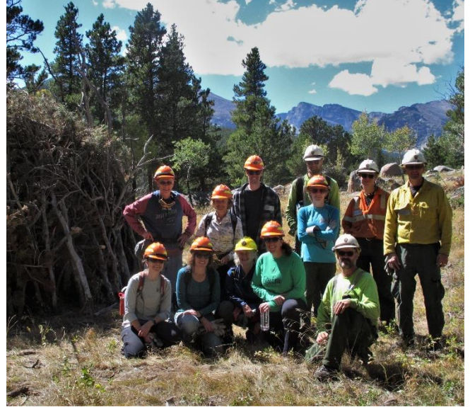
Volunteers honor the National Day of Service and Remembrance by constructing slash piles for fuels reduction work.