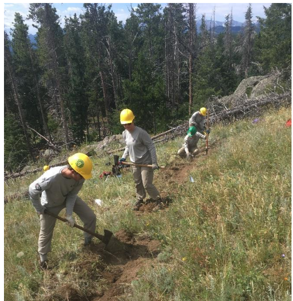
Volunteers and Conservation Corps members rerouting the Bulwark Ridge Trail with Poudre Wilderness Volunteers