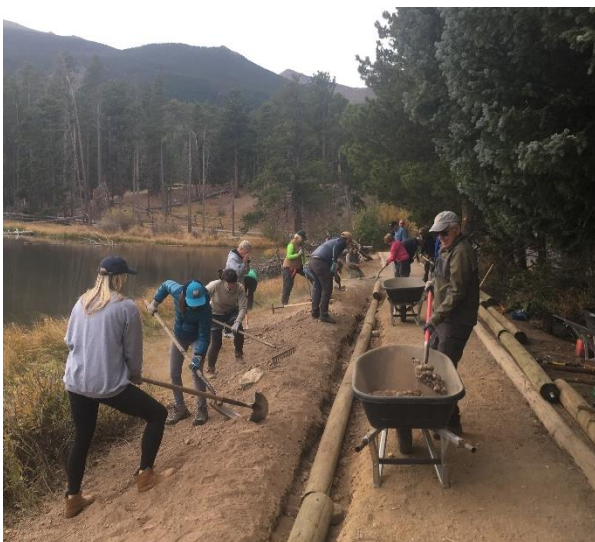
Volunteers fortifying the accessible Sprague Lake Trail with logs and erosion matting to prevent soil loss