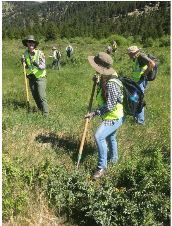
Volunteers use a grid to survey Horseshoe Park, enjoy a laugh while managing musk thistle, and gather for a group photo.